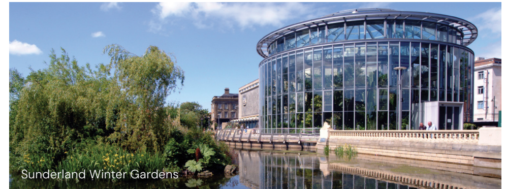
Sunderland Winter Gardens